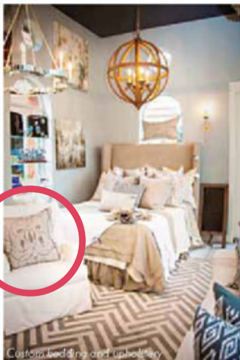
Custom bedding and upholstery

Summer House Lifestyle's studio gallery is located at 36 Uptown Grayton Circle, Santa Rosa Beach, FL 32459. Contact the store at (850) 231-0133 or email mskowlund@me.com . Visit the website at www.summerhouselifestyle.com and find them on Facebook.