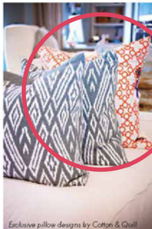
Exclusive pillow designs by Cotton & Quill