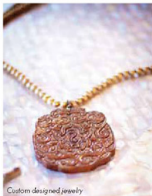
Custom designed jewelry